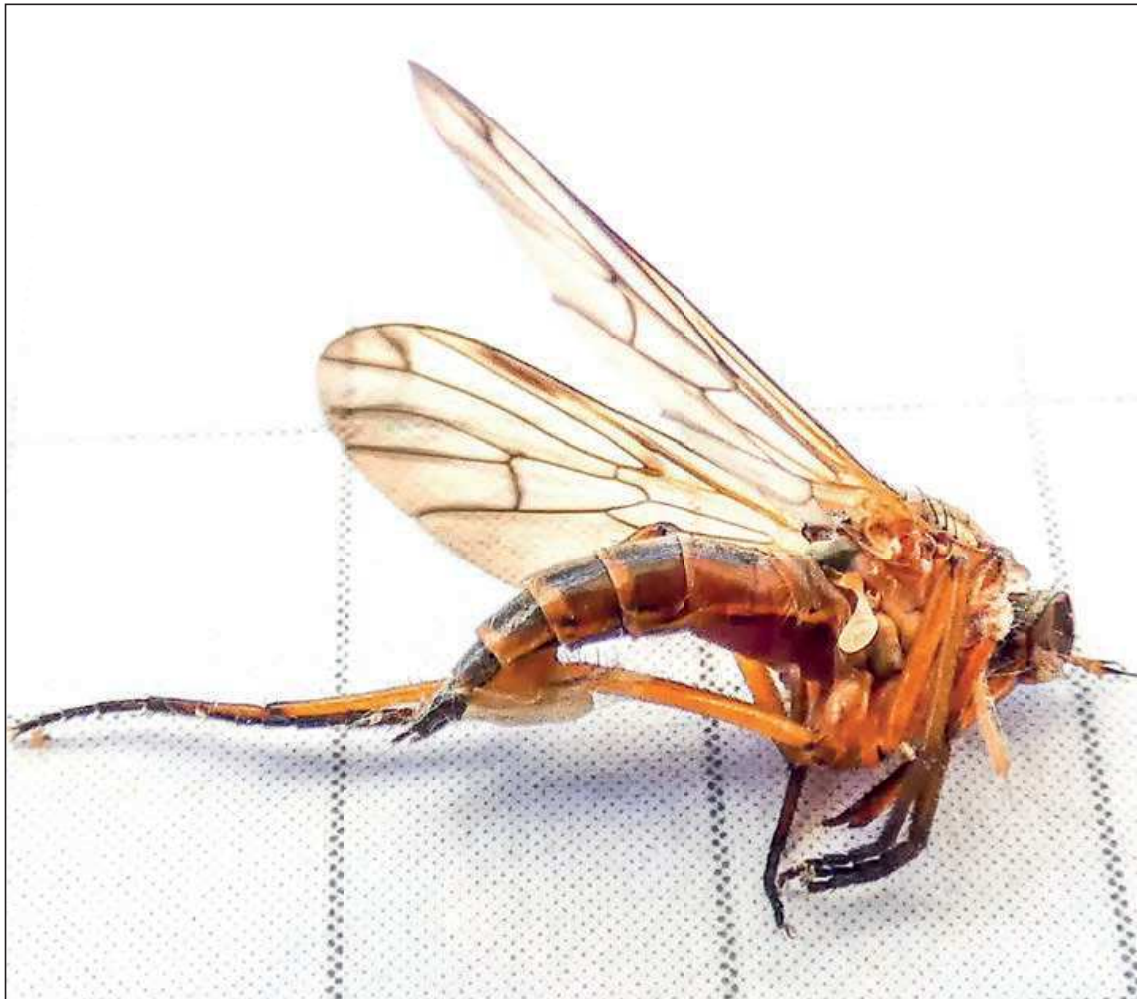
Empis (Leptempis) confusa , Collection Natuurhistorisch Museum Maastricht, 23.V.2020

Resource link: http://www.faunaeur.org ; http://www.faunaitalia.it/checklist/