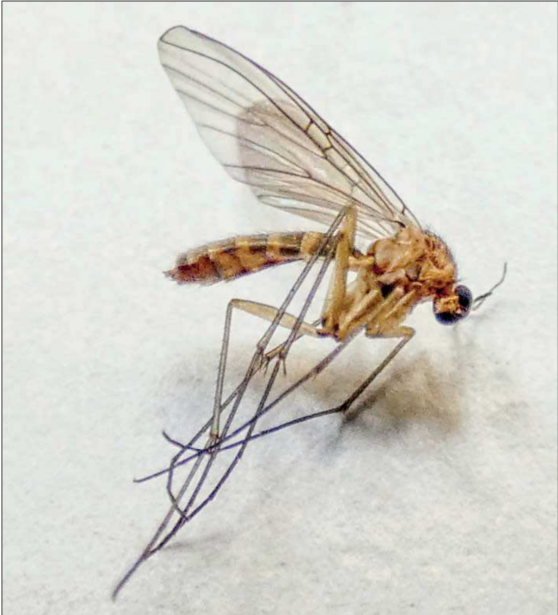
Mycomya (Mycomya) prominens , Collection Natuurhistorisch Museum Maastricht, 5.I.2021

Authors' Addresses — A. DITTA, Via Trieste, 16 – 91026 Mazara del Vallo (Trapani); P.L.T. BEUK, Natuurhistorisch Museum Maastricht, De Bosquetplein, 6-7 – NL 6211KJ Maastricht