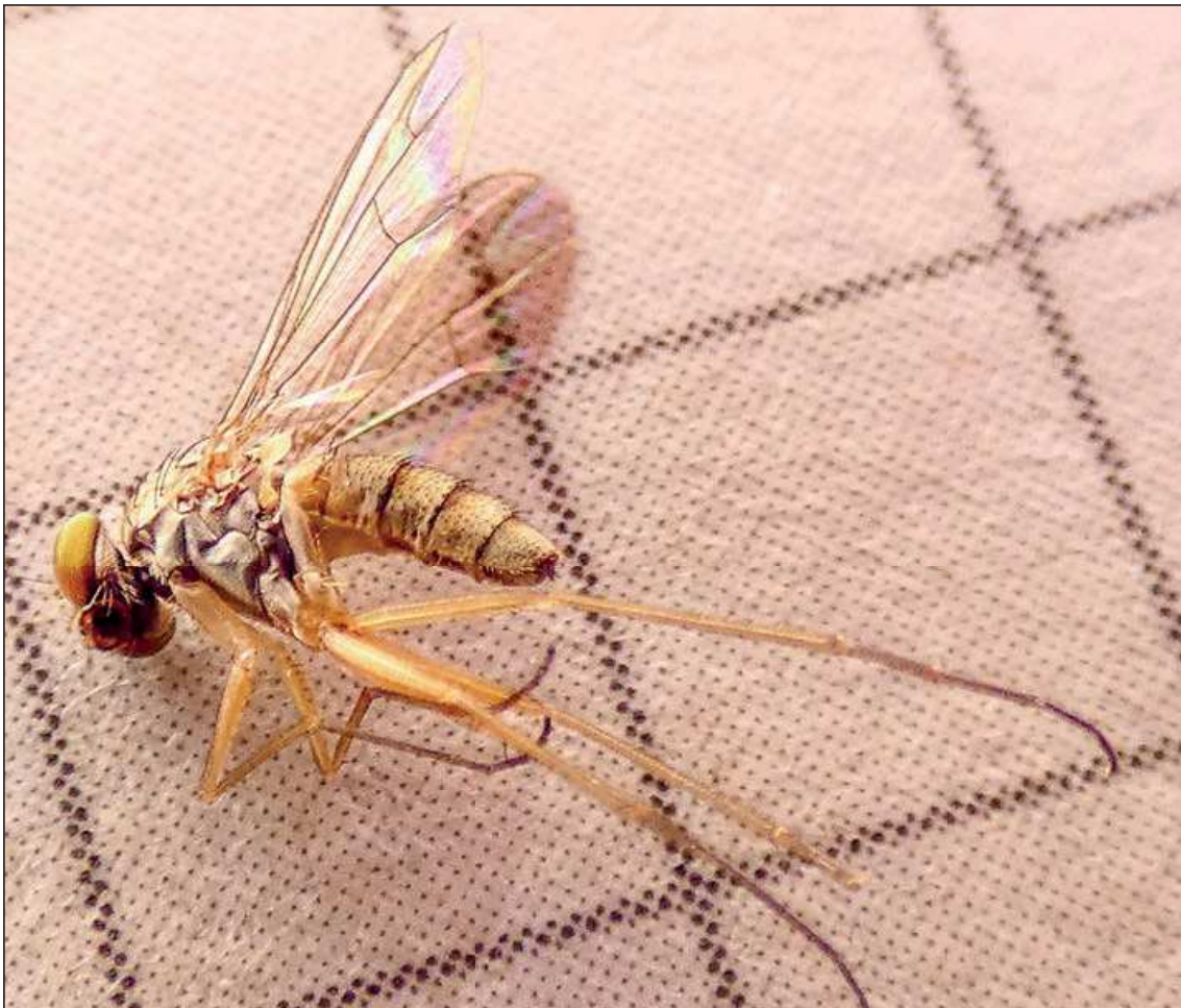
Sciapus platypterus , Collection Natuurhistorisch Museum Maastricht, 15.V.2021

Resource link: http://www.faunaeur.org ; http://www.faunaitalia.it/checklist/