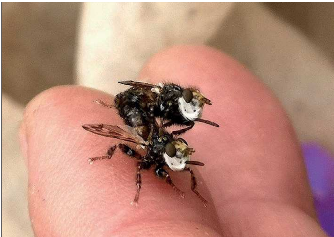
Myopa picta , Nature Reserve Preola Lake and Gorghetti Tondi (Trapani), 18.IV.2021

RIVOSECCHI L., 1996. Chiavi analitiche illustrate sui Conopidae (Diptera) della Fauna Italiana. Boll. Mus. civ. St. nat. Verona , 20: 135-151.