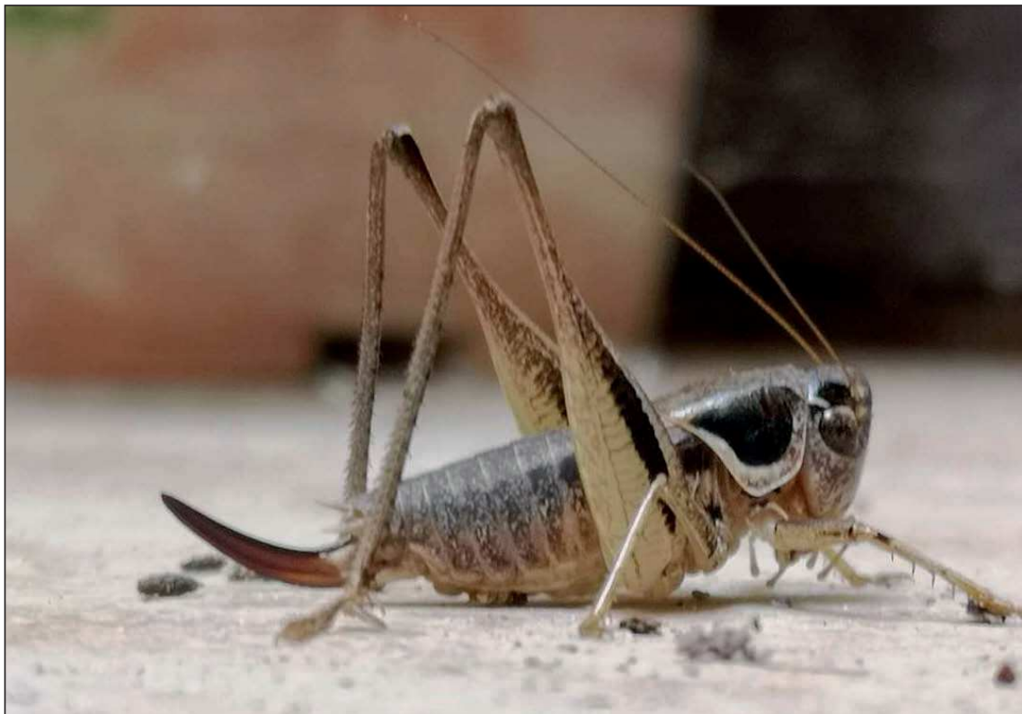
Incertana drepanensis female, 8.IX.2021 (leg. Angelo Ditta)

Category: Species of unusual occurrence for a given area