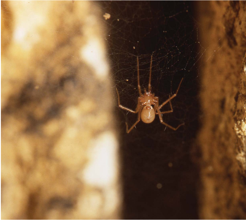
Fig. 2. Troglohyphantes subalpinus (♀) in its typical habitat in the locality Židovske jame.

The subgenus Troglohyphantes is the most widespread subgenus. It is distributed throughout Europe: Cantabria, Pyrenees, Carpathians, Rhodopes, Alps, Apennines and Dinarides (DEELEMEN-REINHOLD, 1978). According to DEELEMEN-REINHOLD (1978) it is divided into 3 series and 12 groups. Series A consists of three groups: furcifer , herculanus and cerberus , series B of five groups: henroti , marqueti , roberti , polyophthalmus and diurnus and series C of four groups: noricus , salax , orpheus and croaticus . Species in our research belong to series B and C.