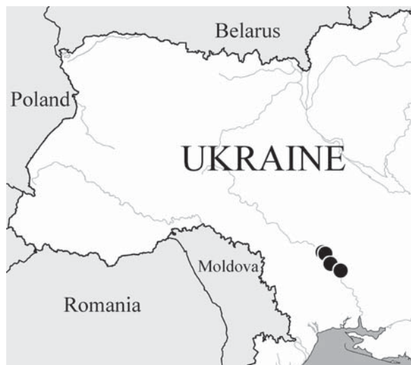
Fig. 1. Map of collecting localities. Рис. 1. Карта с указанием мест сбора.

zone of northern steppes, Dniester-Buh and Kryvyi Rih districts of forb-bunchgrass steppes, bairak forests (natural forests in the gullies in steppe and forest-steppe zones), and the vegetation of granite outcrops [Barbarych, 1997]. Total area of the Park is 6138.13 ha; it consists of three sectors: Myhiiske, Bohdanivske and Trykratske.