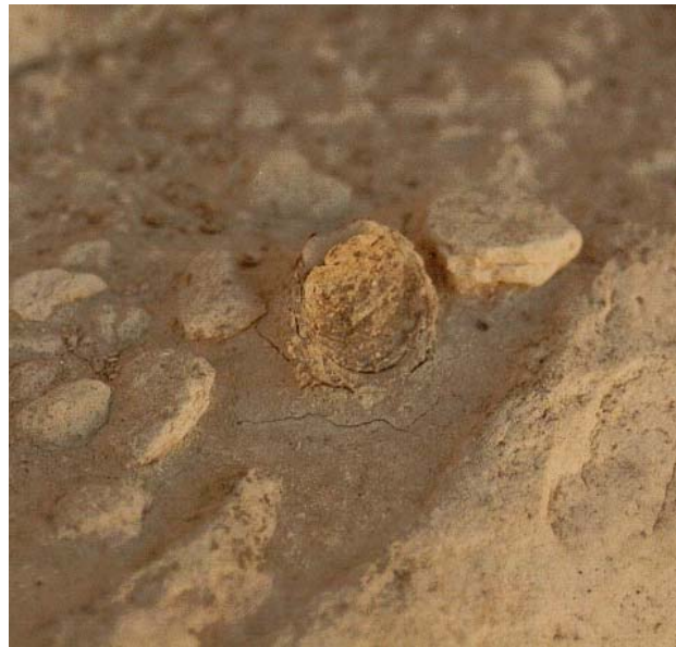
(c) Trap in rocky outcrop with lid closed (left) and open (right)