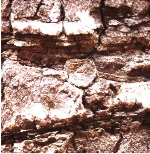
(a) Nest in trunk of Phoenix canariensis .