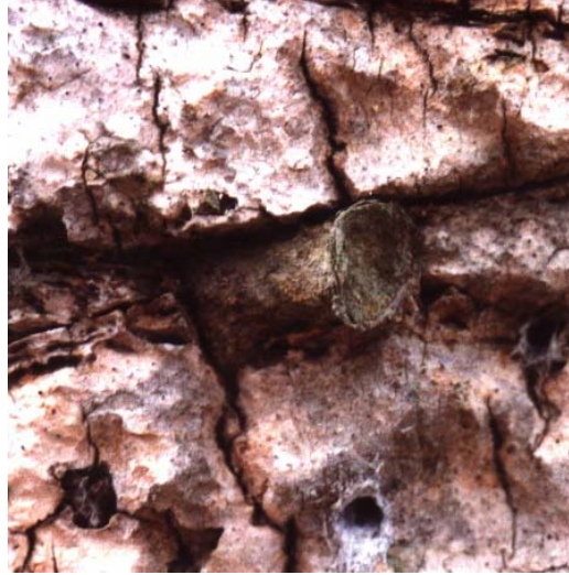
(b) Trap in trunk of P. canariensis with part of tube exposed.